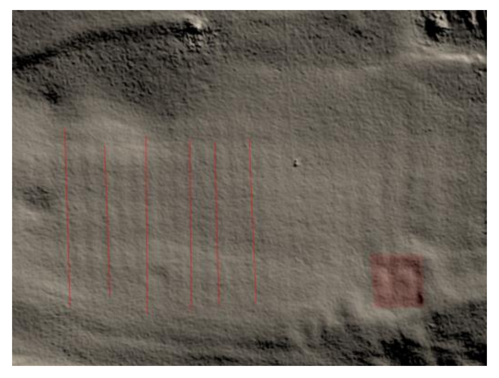
FIGURE 5: INITIAL PROCESSING OF PHOTOGRAMETRY ACROSS AREA OF RESISTIVITY SURVEY SHOWING FEATURES MENTIONED IN TEXT. ONLY FEATURES MENTIONED IN THE TEXT HAVE BEEN IDENTIFIED - THIS WILL BE SUBJECT TO FURTHER ANALYSIS IN THE FINAL REPORT.