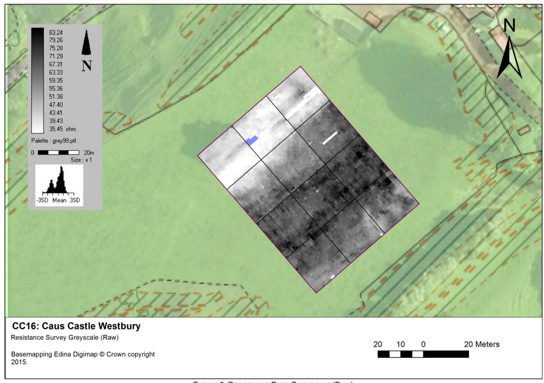
FIGURE 2: RESISTANCE DATA GREYSCALE (RAW)