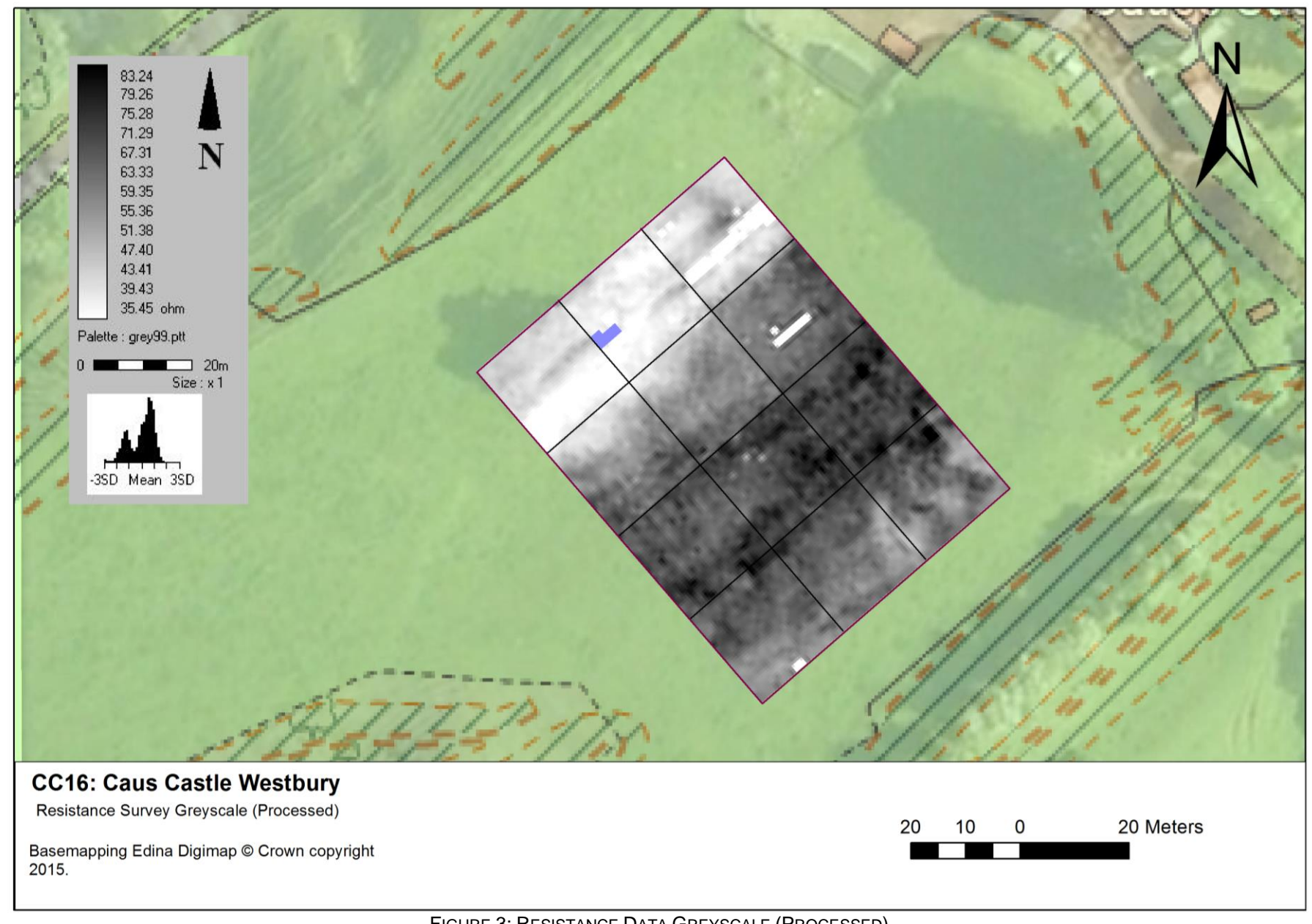
FIGURE 3: RESISTANCE DATA GREYSCALE (PROCESSED)