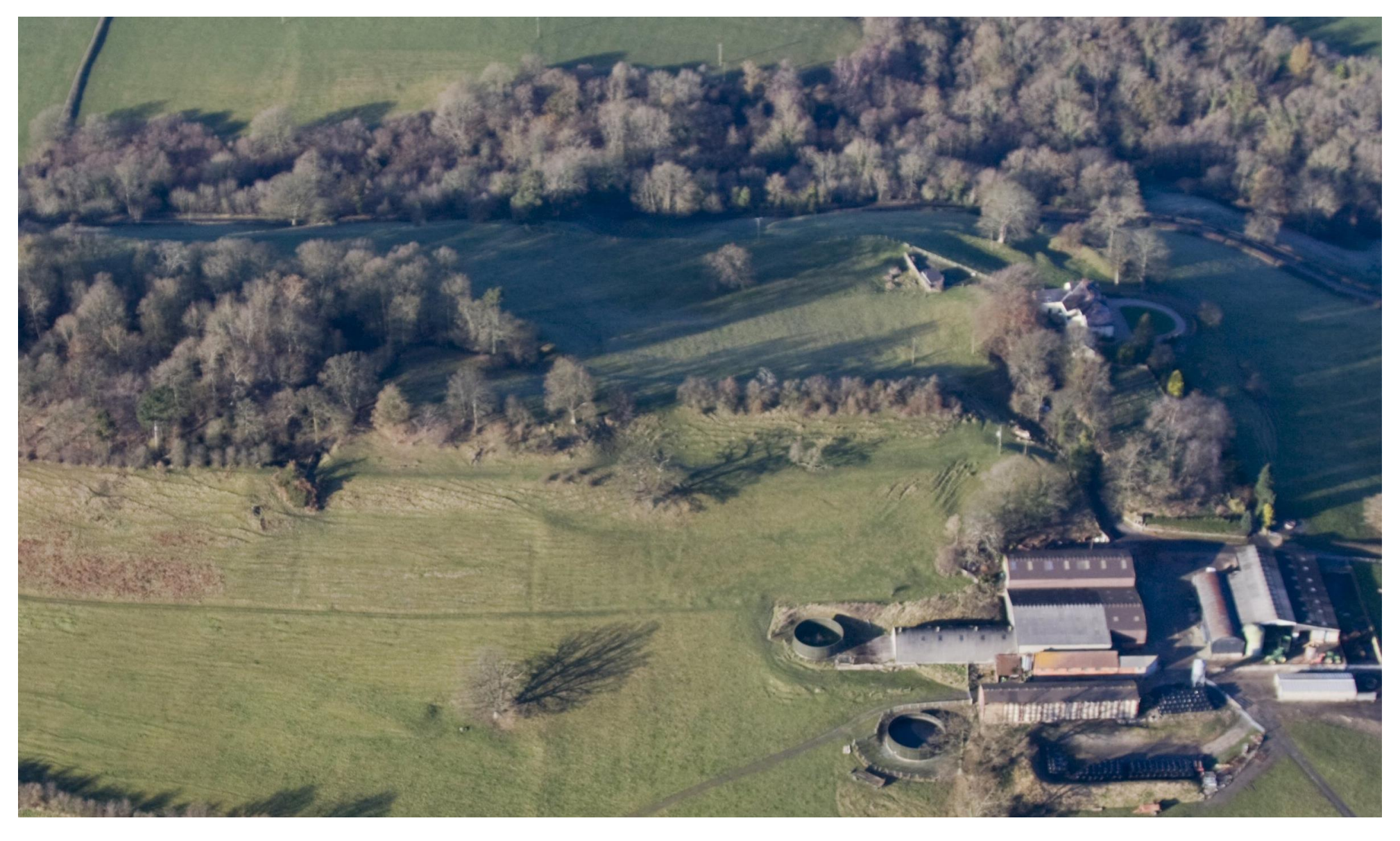
FIGURE 7: 2008 DETAIL FROM AERIAL PHOTOGRAPH BY MICK KRUPA. © SHROPSHIRE COUNCIL. REF 0813_045. RIDGE AND FURROW AND PLATFORM VISIBLE AT OBLIQUE ANGLE.