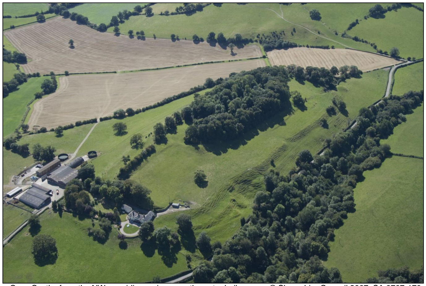
Caus Castle, from the NW, providing a view over the outer bailey area. SA 0707-170.