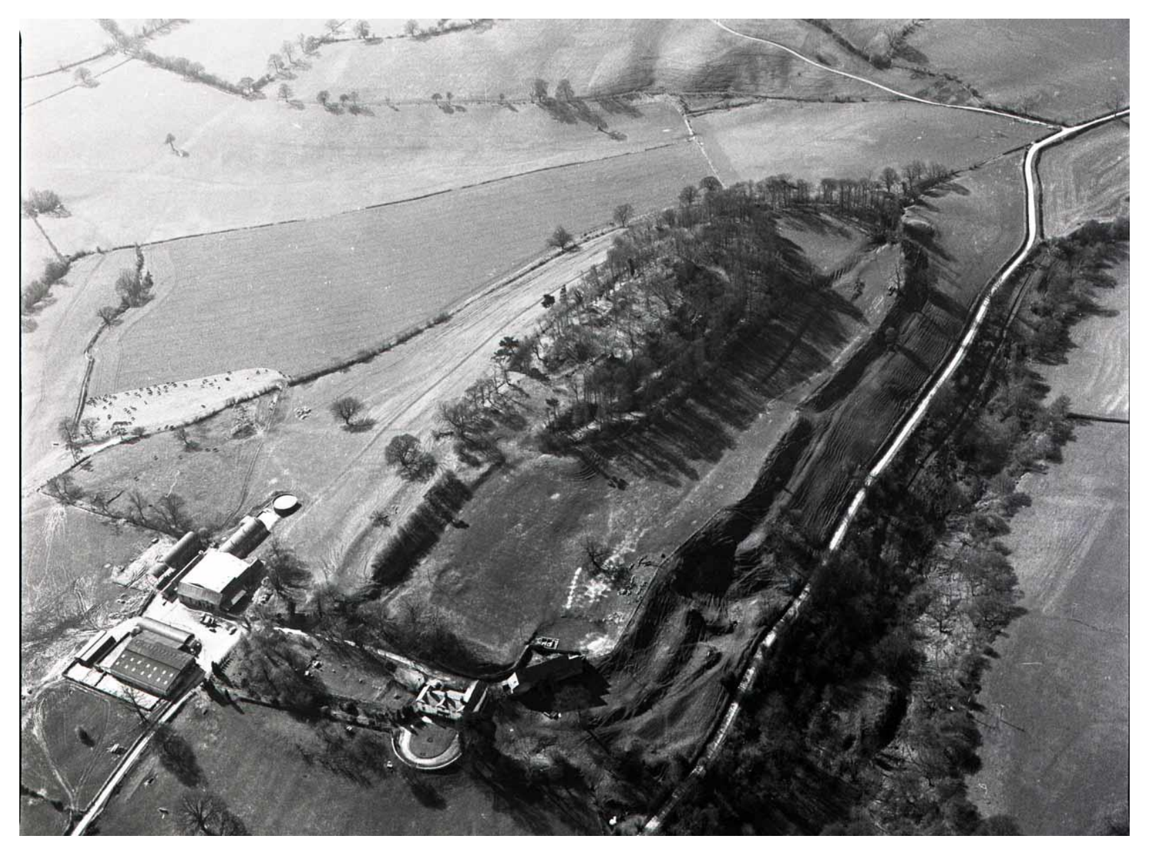
FIGURE 6: 1985 AERIAL PHOTOGRAPH BY CHRIS MUSSON. © CLWYD POWYS ARCHAEOLOGICAL TRUST. REF 85-MB-0019. RIDGE AND FURROW AND PLATFORM CLEARLY VISIBLE (CF. FIGURE 5)